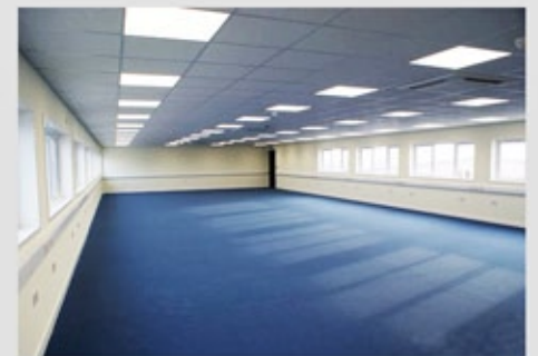
Carpet tiles and suspended ceiling