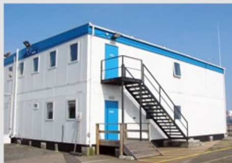
Two-storey office complex