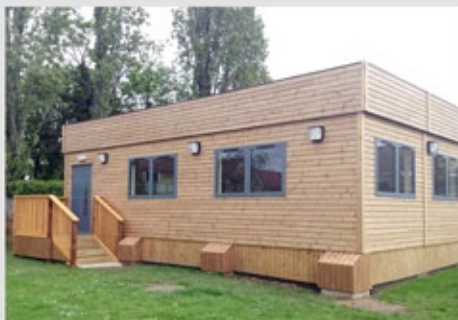
Thermowood clad classroom

Pre-fabricated to meet all current building regulations, our range of new "Spaceframe" modular buildings provide the perfect time and cost saving alternative to a traditional brick & block structure, and can be built as single or multi-storey, and finished externally in a variety of styles to suit the local environment.