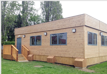
Thermowood clad classroom

Pre-fabricated to meet all current building regulations, our range of new "Spaceframe" modular buildings provide the perfect time and cost saving alternative to a traditional brick & block structure, and can be built as single or multi-storey, and finished externally in a variety of styles to suit the local environment.