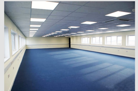
Carpet tiles & suspended ceiling