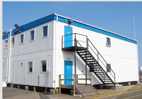
2 storey office complex