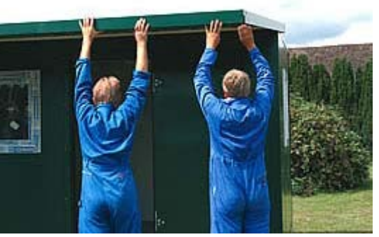
Fit the outer roof skin