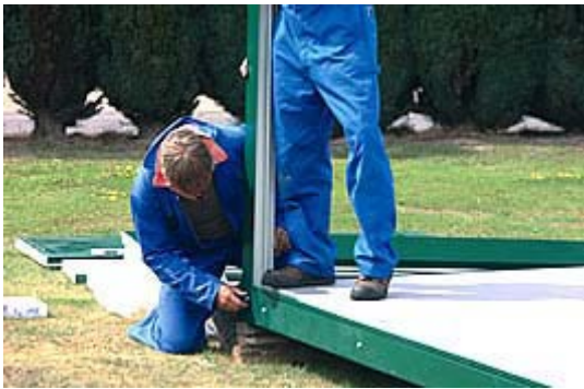
Fix the four corner posts