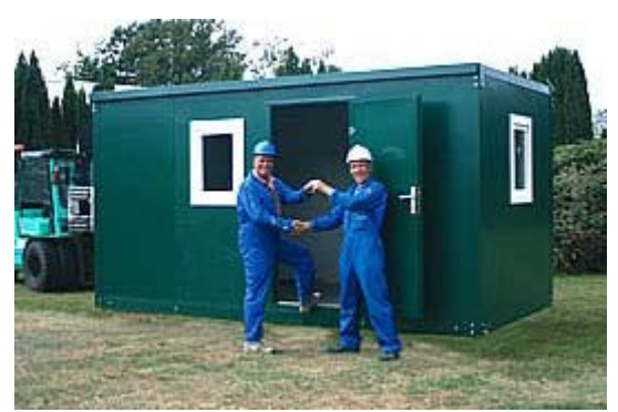
The Garden Office is now ready for use