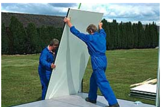
Slide in the wall, door & window panels