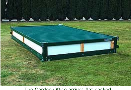
The Garden Office arrives flat packed