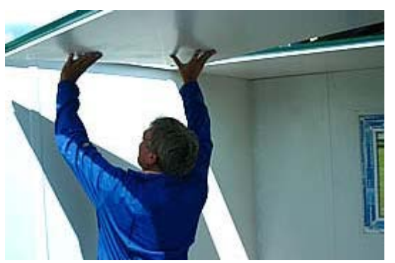
Slide in the ceiling panels