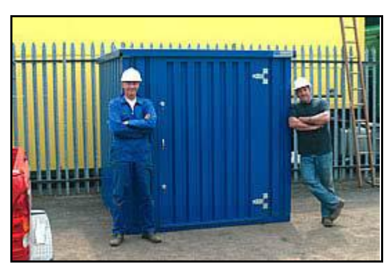
The Expandastore flat-packed man-portable storage container is now complete and ready for use