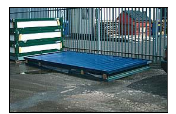
The Expandastore arrives in flat-packed form