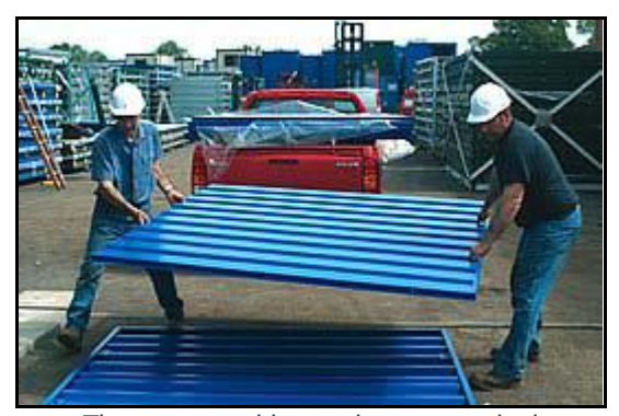
The man-portable panels are unpacked